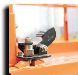
Platform Extension Footlock