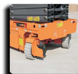
Compact Turning Radius