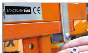
Tamperproof security fixings stops unauthorised removal