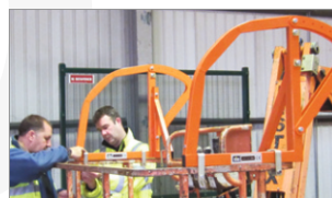
Fully adjustable for easy fitting on or off site