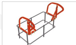
Sacrificial steel structure protects operator and machine