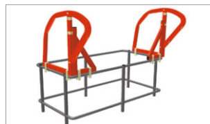
Strong and robust frame weighing only 22kg

* The visuals 1 - 3 are of a representative machine platform only.